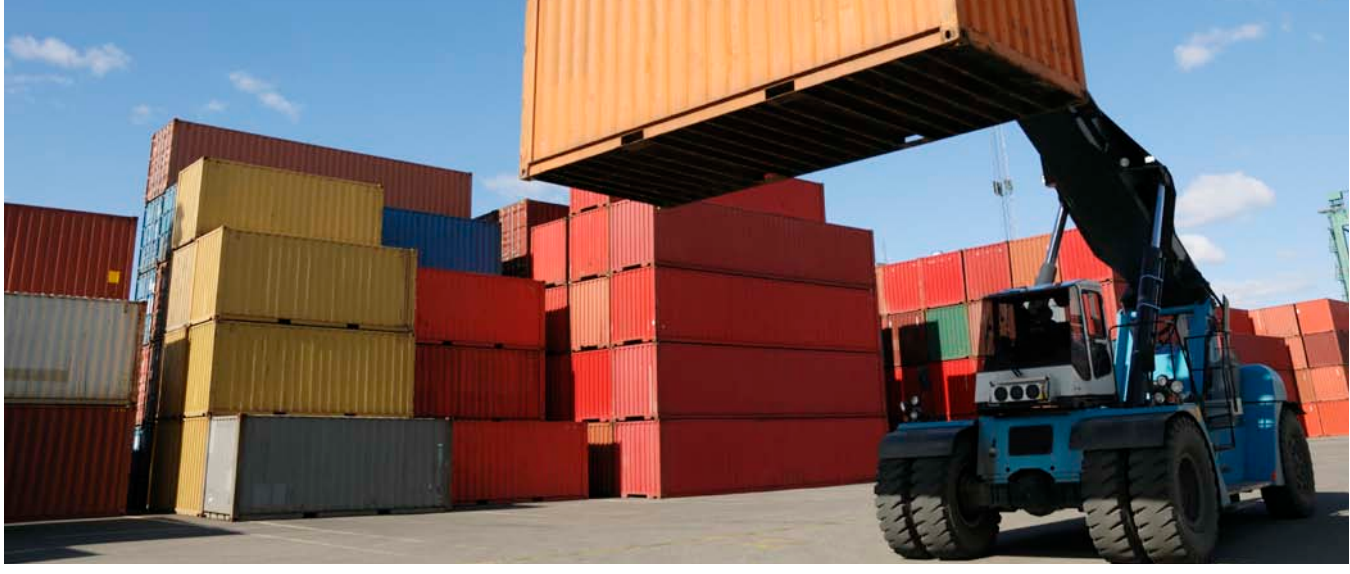
For more information visit www.NewJerseyBusiness.gov